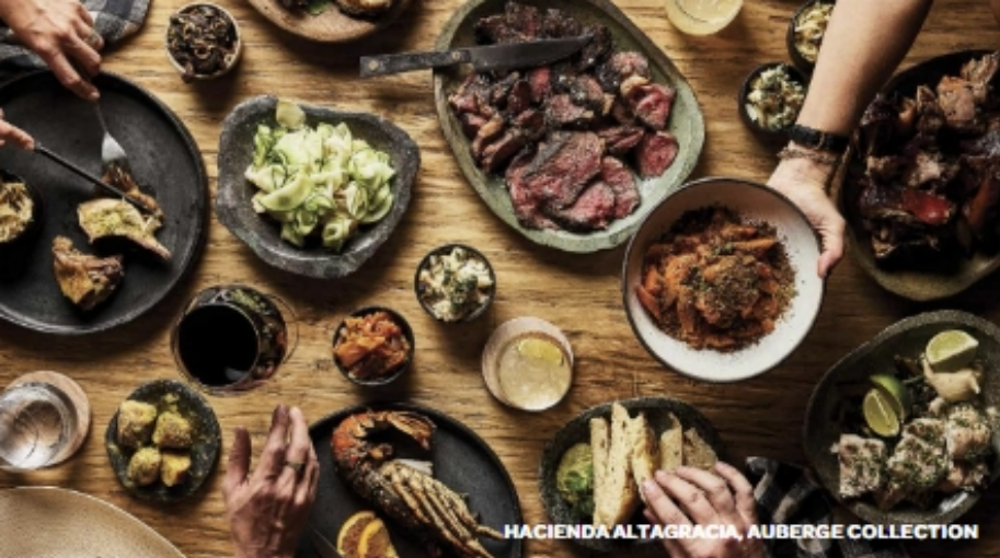
HACIENDA ALTAGRACIA, AUBERGE COLLECTION