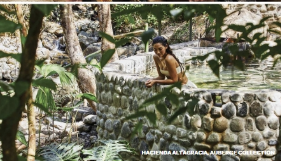
HACIENDA ALTAGRACIA, AUBERGE COLLECTION