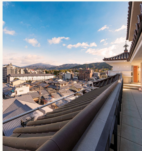
TOP AND RIGHT: The Executive Lounge at the hotel. ABOVE: The panoramic view from the Imperial Suite.

The North Wing introduces tatami flooring for the first time