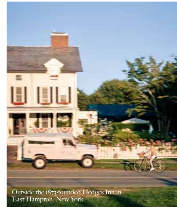
Outside the 1873-founded Hedges Inn in East Hampton, New York