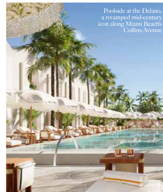
Poolside at the Delano, a revamped mid-century icon along Miami Beach's Collins Avenue