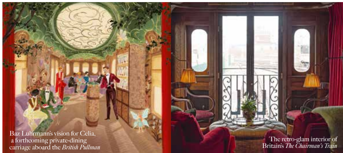
Baz Luhrmann's vision for Celia, a forthcoming private-dining carriage aboard the British Pullman