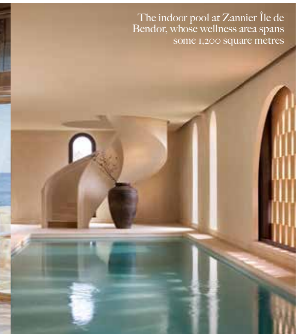
The indoor pool at Zannier Île de Bendor, whose wellness area spans some 1,200 square metres