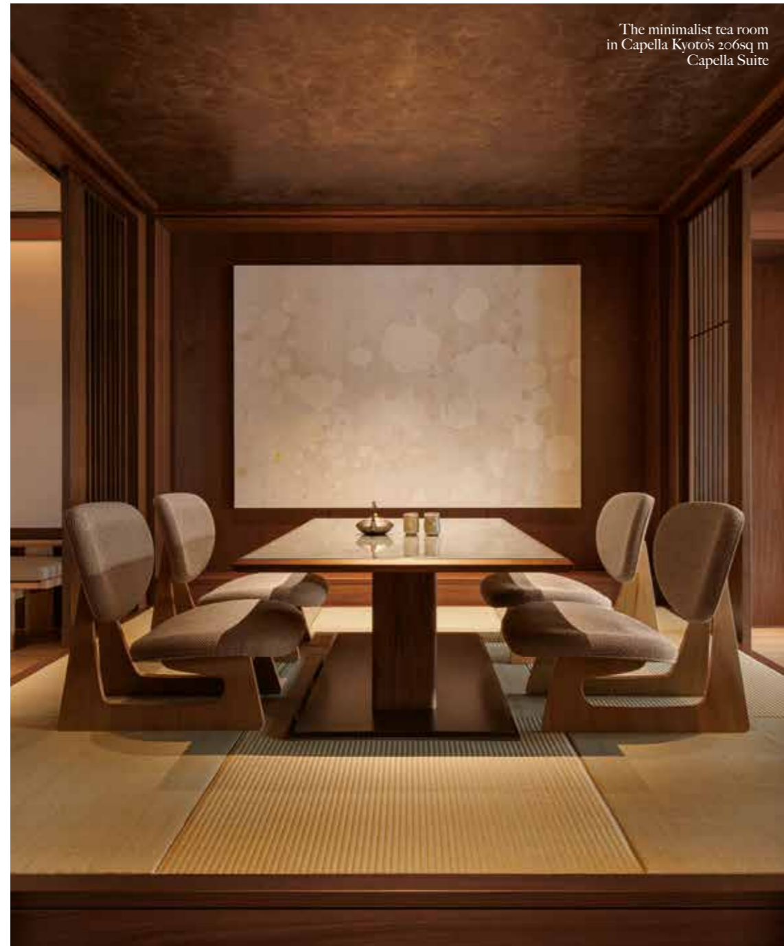
The minimalist tea room in Capella Kyoto's 206sq m Capella Suite

Japan's erstwhile capital is back in the spotlight, thanks to two new hotels that showcase different aspects of the ever-evolving city. The Imperial Hotel ( imperialhotel.co.jp ) – the first new opening from the celebrated Tokyo-based brand in 30 years – is set in a historic former theatre, while Capella Kyoto ( capellahotels.com ) is a Kengo Kuma-designed new build in the central Miyagawa-cho district, just steps from the city's oldest Zen Buddhist temple.