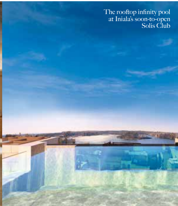
The rooftop infinity pool at Iniala's soon-to-open Solis Club