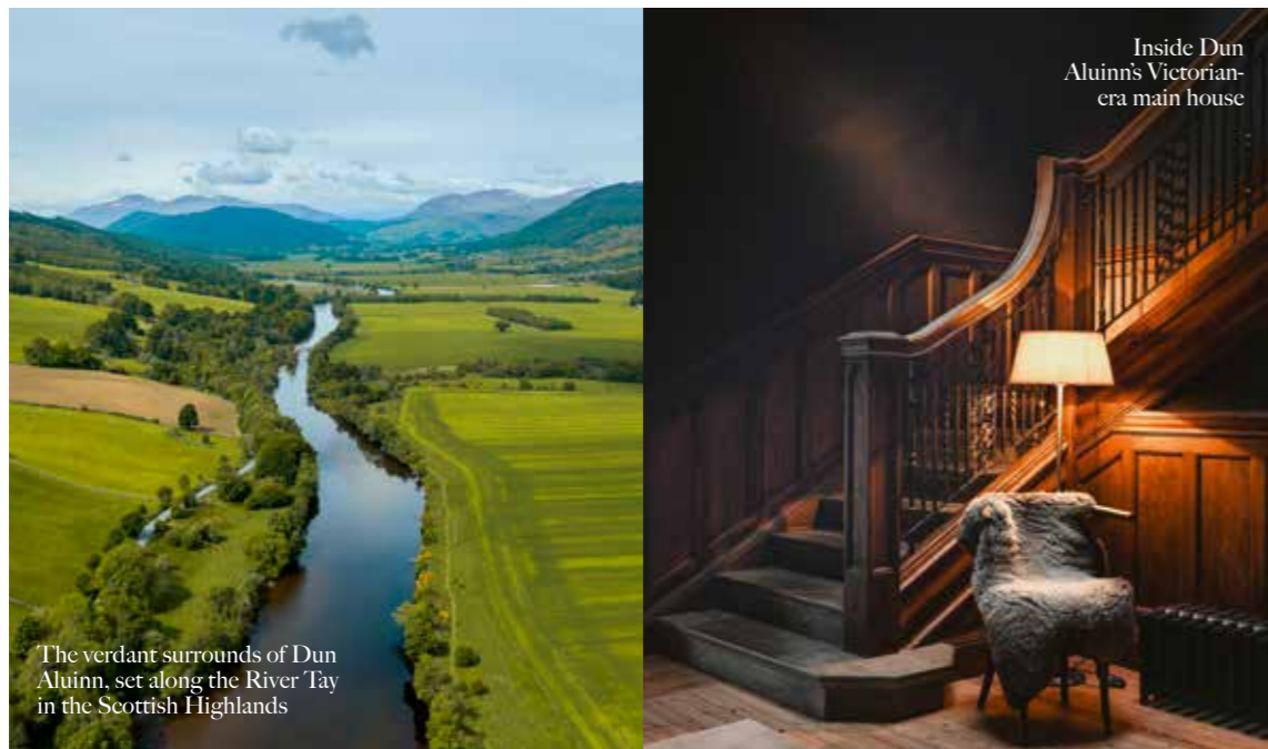
The verdant surrounds of Dun Aluinn, set along the River Tay in the Scottish Highlands