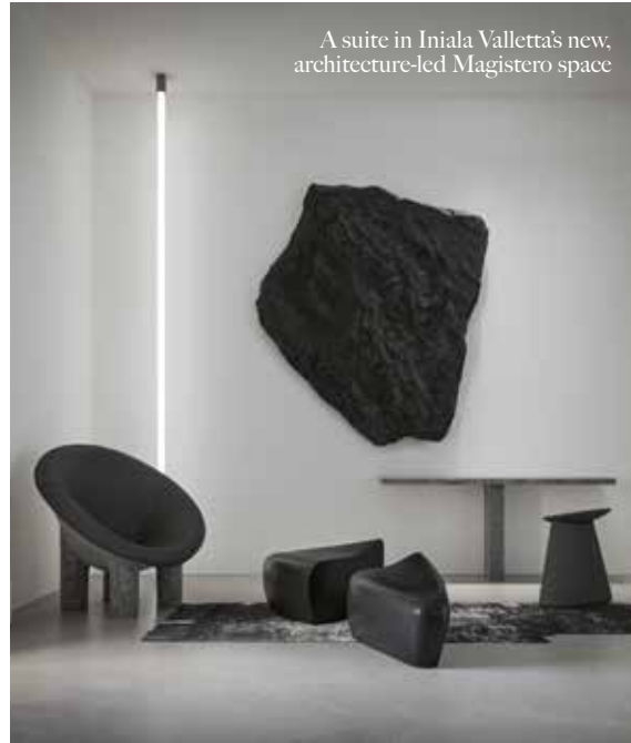
A suite in Iniala Valletta's new, architecture-led Magistero space