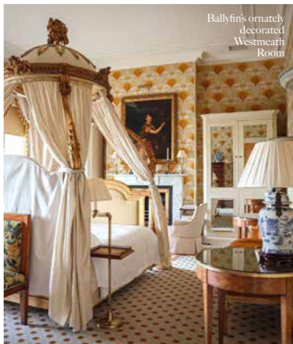
Ballyfin's ornately decorated Westmeath Room

Of the hundreds of historic mansions across Britain and Ireland now operating as hotels, how many still feel like real homes? Three newly reimagined estates are aiming to pair grand old bones with heartfelt contemporary hospitality. At Ballyfin ( ballyfin.com ), in County Laois, southwest of Dublin, 21 guest rooms are individually decorated with nods to the Regency-era manor's past, while the Michelin-star restaurant spotlights local produce. In Scotland, the formerly exclusive-hire-only Dun Aluinn ( dunaluinn.com ) has just been renovated, and its nine rooms, now available to book separately, are prime home bases from which to explore Perthshire and the Highlands. A £25m makeover has brought a renewed sense of regal splendour to Dumbleton Hall ( dumbletonhall.co.uk ), set in a charmed corner of the Cotswolds between Stratford-upon-Avon and Cheltenham.