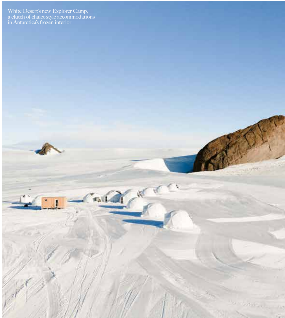
White Desert's new Explorer Camp, a clutch of chalet-style accommodations in Antarctica's frozen interior