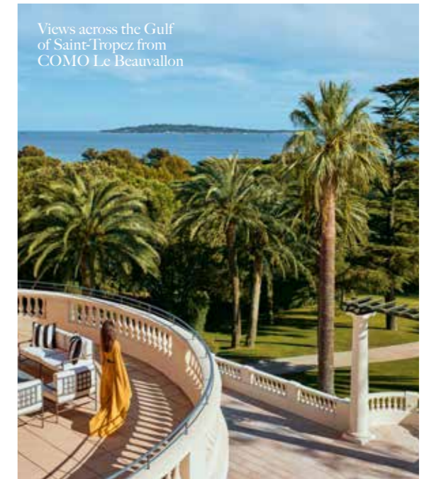
Views across the Gulf of Saint-Tropez from COMO Le Beauvallon

Some places never go out of style. The South of France – perhaps the most perennially chic place on the planet – is having a banner year once again, headlined by three properties that meld historic legacies with contemporary panache. The creation of Zannier Île de Bendor ( zannierhotels.com ) was a passion project: a private island off Bandol, it was initially developed by pastis pioneer Paul Ricard in the 1950s, and its new incarnation comes by way of growing French hospitality brand Zannier, which has introduced a sprawling, village-like hotel to the island, along with an expansive wellness centre and an array of bars and restaurants. Back on the mainland, COMO Le Beauvallon ( comohotels.com ) is a 42-key Riviera classic, looking out over the Gulf of Saint-Tropez to the latter's namesake town. The Belle Époque palace has been newly reconceived and now boasts the culinary nous of Yannick Alléno at its waterside restaurant. Farther along the coast, between Nice and Monaco, La Réserve de Beaulieu's recent renovation ( reservebeaulieu.fr ), completed last year, has sharpened the timeless allure of the dramatically set hideaway along the glittering Beaulieu-sur-Mer coastline.