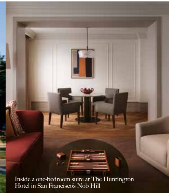
Inside a one-bedroom suite at The Huntington Hotel in San Francisco's Nob Hill