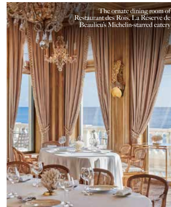
The ornate dining room of Restaurant des Rois, La Réserve de Beaulieu's Michelin-starred eatery

Some places never go out of style. The South of France – perhaps the most perennially chic place on the planet – is having a banner year once again, headlined by three properties that meld historic legacies with contemporary panache. The creation of Zannier Île de Bendor ( zannierhotels.com ) was a passion project: a private island off Bandol, it was initially developed by pastis pioneer Paul Ricard in the 1950s, and its new incarnation comes by way of growing French hospitality brand Zannier, which has introduced a sprawling, village-like hotel to the island, along with an expansive wellness centre and an array of bars and restaurants. Back on the mainland, COMO Le Beauvallon ( comohotels.com ) is a 42-key Riviera classic, looking out over the Gulf of Saint-Tropez to the latter's namesake town. The Belle Époque palace has been newly reconceived and now boasts the culinary nous of Yannick Alléno at its waterside restaurant. Farther along the coast, between Nice and Monaco, La Réserve de Beaulieu's recent renovation ( reservebeaulieu.fr ), completed last year, has sharpened the timeless allure of the dramatically set hideaway along the glittering Beaulieu-sur-Mer coastline.